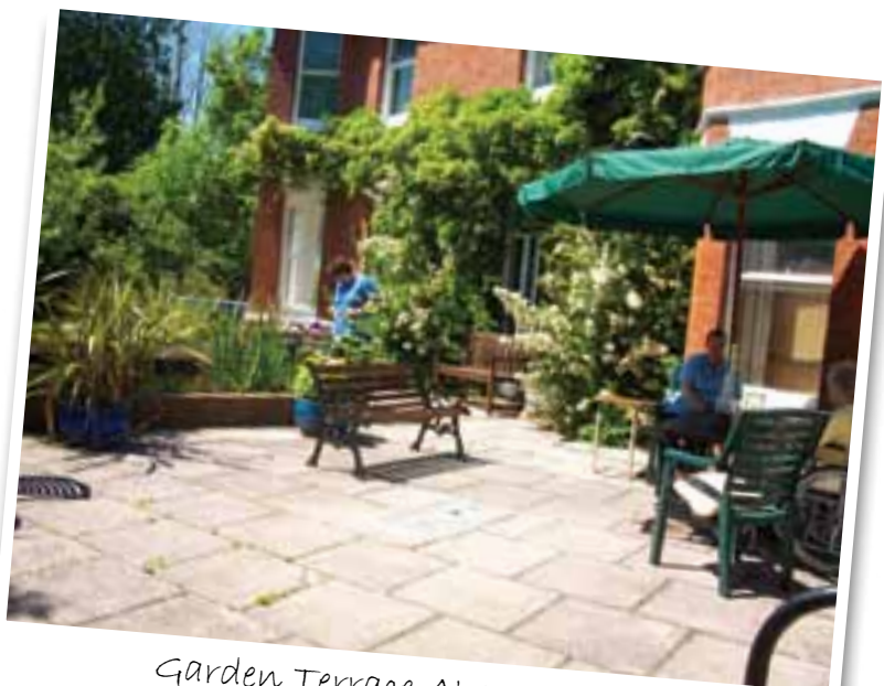
Garden Terrace At Rose Lodge