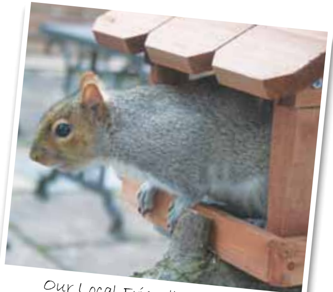
Our Local Friendly Squirrel

Inside there is a large spacious living room where you can join in with the community and chat with friends. Or if you prefer to be alone a smaller living room is available where you can sit and relax