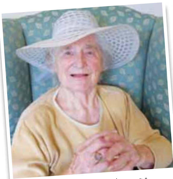
Relaxing in the lounge