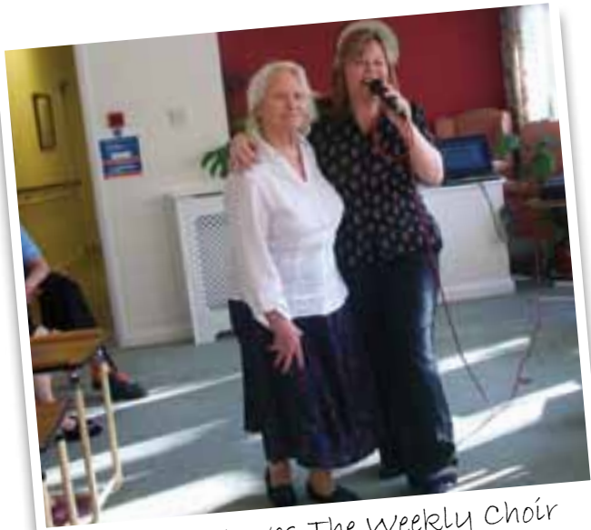
Everyone Loves The Weekly Choir

A highlight of each day is meal time in the dining area where we serve wholesome and delicious home cooked food. All tastes are catered for and if you have any special meal or dietary requirements just let us know and we'll try to accommodate your needs.