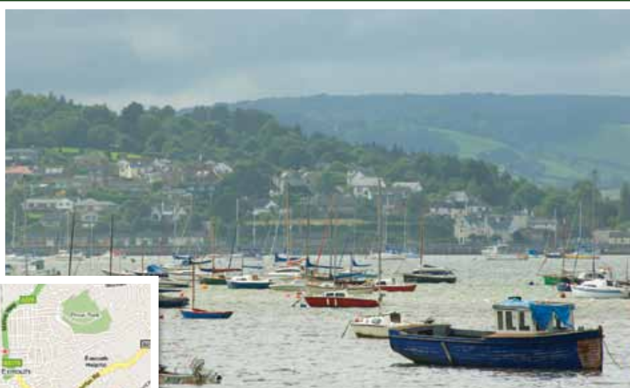
Boats at Exmouth

For further details please contact the home manager on 01395 227071 or feel free to visit us anytime to have a look around and chat about your requirements. We'd really love to hear from you.